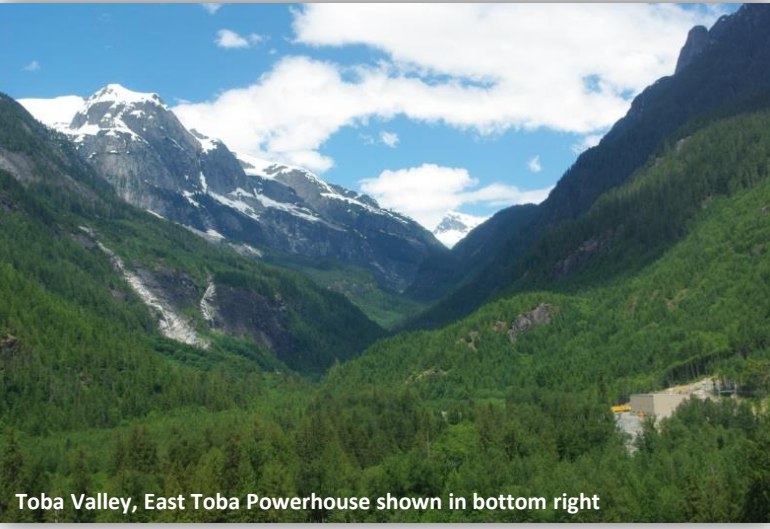
Toba Valley, East Toba Powerhouse shown in bottom right